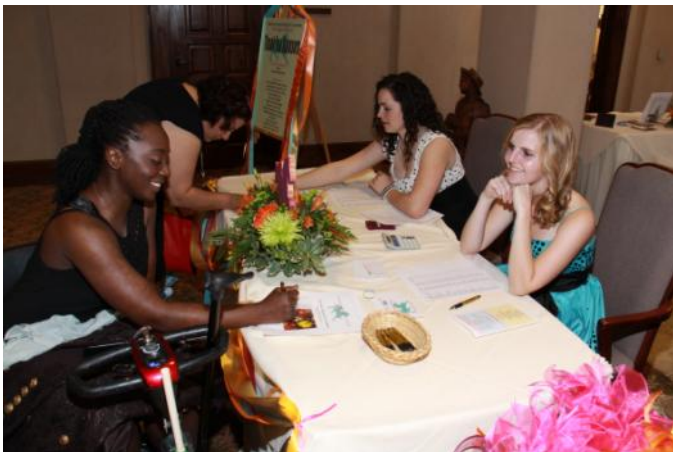
Several wounded warriors were among those attending the Magic of Horses benefit dinner.